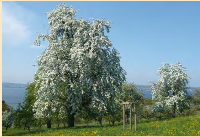
Photo: Floral splendour of a Grünmöstler tree on Lake Constance

Pomology is the science of fruit species and varieties. It includes their identification, description, recommendation and preservation.