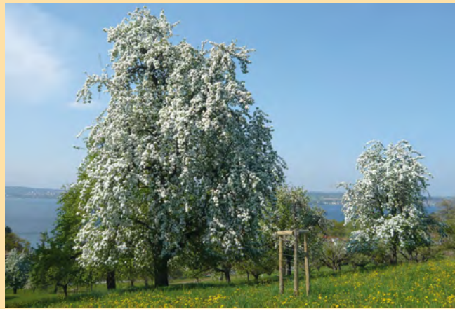
Photo: Floral splendour of a Grünmöstler tree on Lake Constance

Pomology is the science of fruit species and varieties. It includes their identification, description, recommendation and preservation.