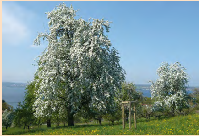
Photo: Floral splendour of a Grünmöstler tree on Lake Constance

Pomology is the science of fruit species and varieties. It includes their identification, description, recommendation and preservation.